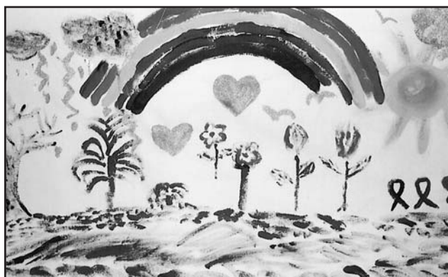
Figure 2 Quilt Detail

depending on how many staff members were in a session. At the end of each session, everyone had a chance to process the art.